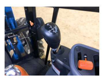
Integrated Loader Joystick Enables Precise Control Of The Front-Loader