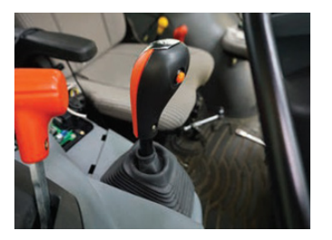
Hand Clutch The Hand Clutch Button Added To The Gear Control Lever Enables You To Change Gears Easily