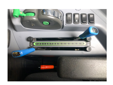
Position And Draft Control Three Point Accommodates A Variety Of Implement Needs