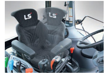
Premium Seat The Air Suspension Seat With 10 Degree Swivel For Added Comfort