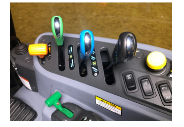
Ergonomic Right-Side Console Provides Unobstructed Access To Control Levers