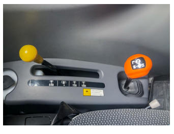
540/750/1000 PTO Provides Compatibility To A Large Number Of Implements